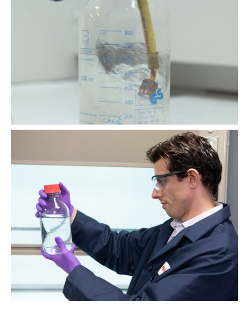
Image shows Solstice LBA being dispensed into an open container. NOTE: Solstice GBA MUST be dispensed into an appropriate pressure-rated container or process line of a closed system.

Therefore, dispense Solstice GBA directly into an appropriate pressure-rated container or process line of a closed system. If you have questions, refer to the Solstice GBA conversion manual or contact your Honeywell representative.