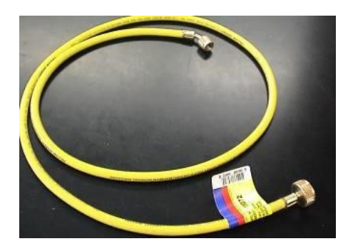
A liquid discharge line with a CGA-660 connection and gasket is required