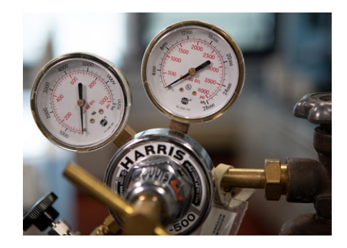
Prepare the nitrogen cylinder

Then, check that the gas hose is attached and tightly secured to the nitrogen regulator discharge connection. Remember, it is essential that the gas hose is rated for nitrogen use.