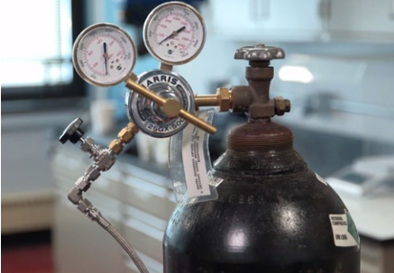
A two-stage nitrogen regulator is required.