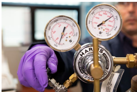
A two-stage nitrogen regulator is required