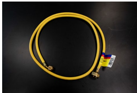
A liquid discharge line with a CGA-660 connection and gasket is required