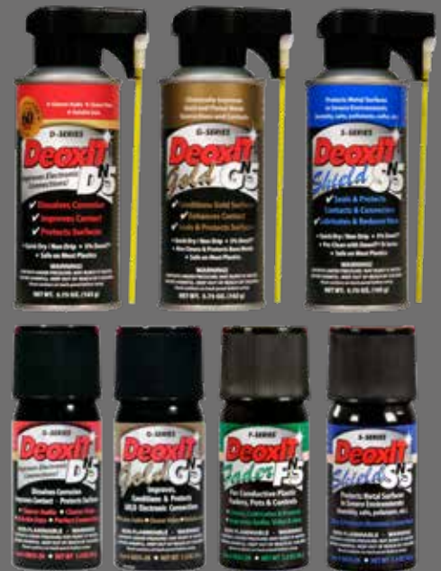
Honeywell Solstice propellant is used in seven CAIG DeoxIT products.