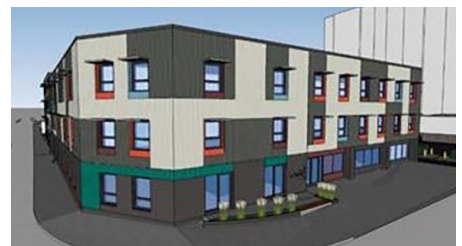
Parkdale Landing's design is intended to draw people's attention and be an exciting new element for East Hamilton.