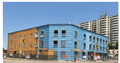
Closed-cell spray foam is being applied over the membrane on the exterior walls to meet Passive House requirements.