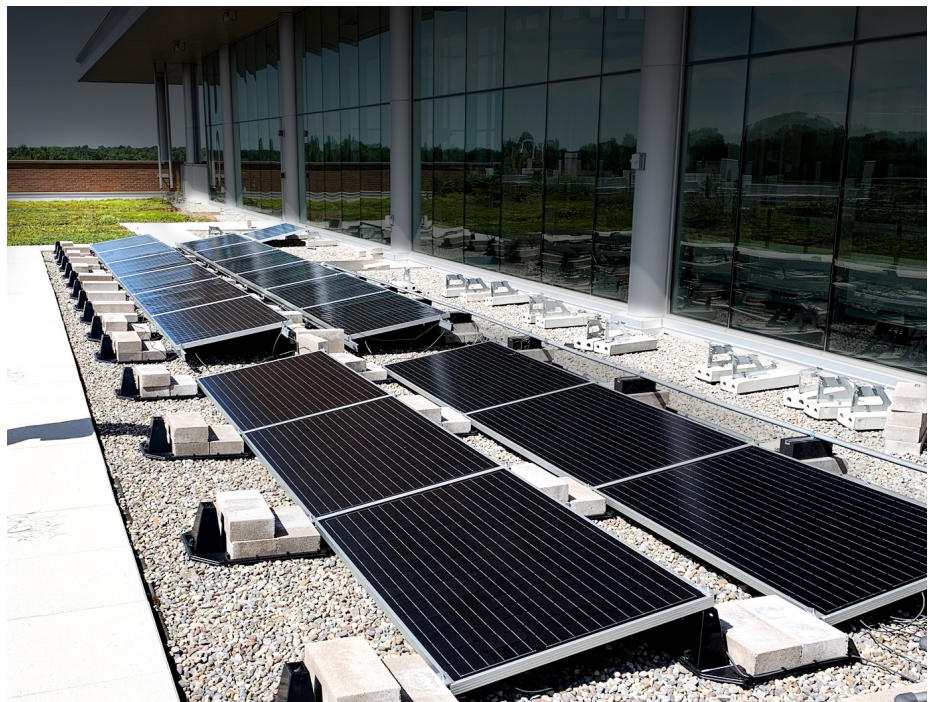
PV modules in a test installation from Tyll Solar in Rochester

Reflecting 25 years' experience providing solutions to the aluminum brazing industry, Honeywell jetflux is a thixotropic paste incorporating flux particles several times smaller than the diameter of a human hair – particles that would normally be too small to be used safely with powdered flux. The technology prevents hard sediments