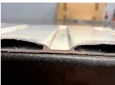
Channel plate after brazing

from forming in process equipment and from blocking jet nozzles. The particles have an extremely low melting onset, giving them more time to react to and disrupt the oxide and thus promote brazed joint formation.