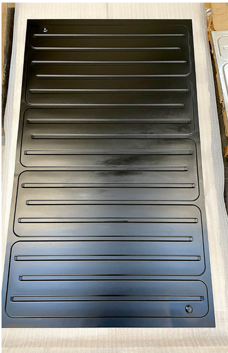
Channel plate produced with our jetflux braze material.