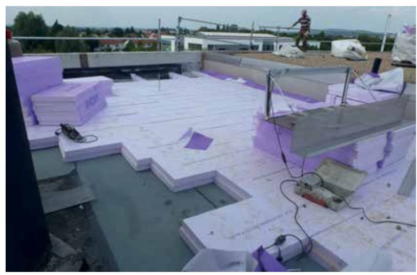
Inverted roof insulation with JACKODUR Plus for University of Applied Sciences in Lemgo

Hence the company's search for a gas blowing agent (GBA) that would help improve on Lambda levels of 34-37 mW/mK using {\rm CO_2} (JACKODUR KF) or HFC-152a (JACKODUR CFR). XPS produced using HFC-134a exhibited better thermal conductivity (29-31 mW/mK) but at a high global warming potential (GWP) of 1,300*1.